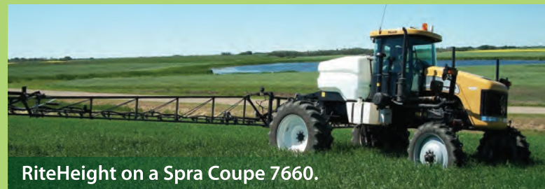
RiteHeight on a Spra Coupe 7660.