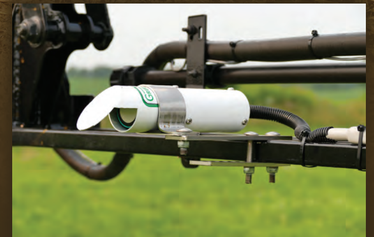
Compact sensor brackets allow for a variety of mounting options.