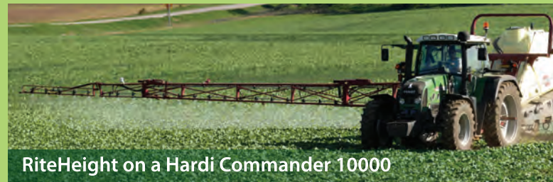
RiteHeight on a Hardi Commander 10000