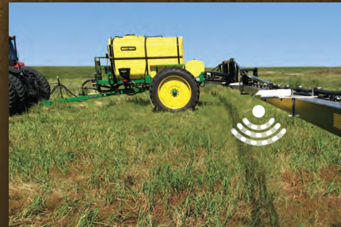
RiteHeight on a Bestway Fieldpro sprayer with 90ft boom.