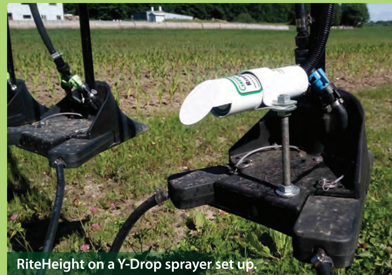
RiteHeight on a Y-Drop sprayer set up.

"I installed the 2-sensor RiteHeight system six seasons ago. No service or repairs needed since. Still works like new. I'm really pleased with it. Great value package!"