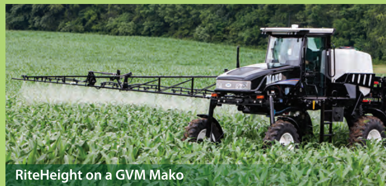
RiteHeight on a GVM Mako