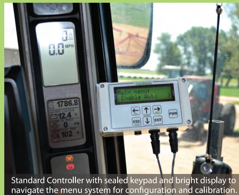
Standard Controller with sealed keypad and bright display to navigate the menu system for configuration and calibration.

– John Vanderlinde, Glencoe, ON; Rogator 664 with 120ft booms