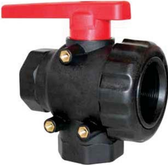
3 WAY BALL VALVE - CONTINUOUS FLOW